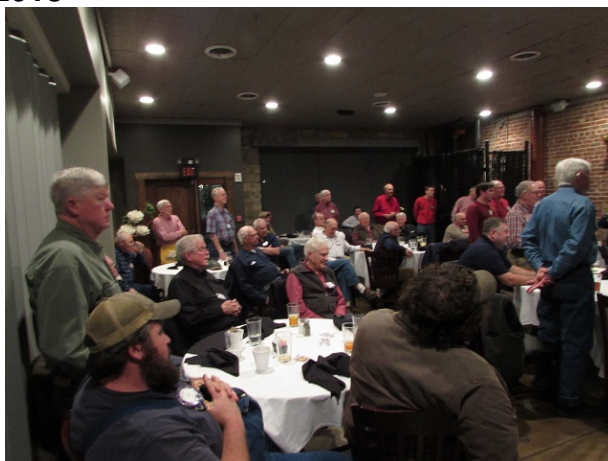
We stood, in-turn, to show support for our favorite team as they were announced. I think this photo shows those supporting Alabama.