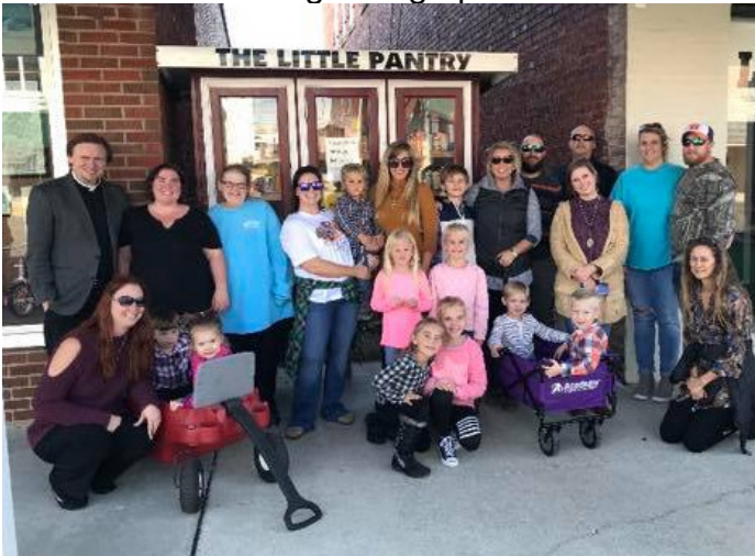
The Little Pantry with a host of supporters. It really just looks like a pantry with 3 cabinets with shelves.

since it was started in April 2017. Cullman's Little Pantry is a 5013c non-profit. Its mission is to help those that are in need. It is a place where supporters can leave non-perishables if they have more than they need. And it is a place where those in need are allowed to take items when they need it. The pantry can accept canned or dried vegetables & meats, dog and cat food, hygiene products, laundry items, and almost anything that does not need refrigeration.