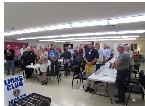
Commission Meeting Room

The Commission on Aging Building was outstanding as a meeting place. It is handicap friendly, the right size, and the AC worked like a charm. Additionally, the acoustics do not require amplification for a speaker to be heard. The Club members voted a $100 honorarium for each time the Club meets in lieu of no rent.