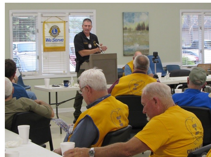
Page 4 of 6