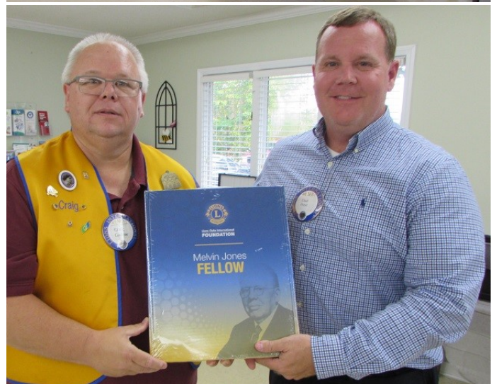
Page 2 of 6