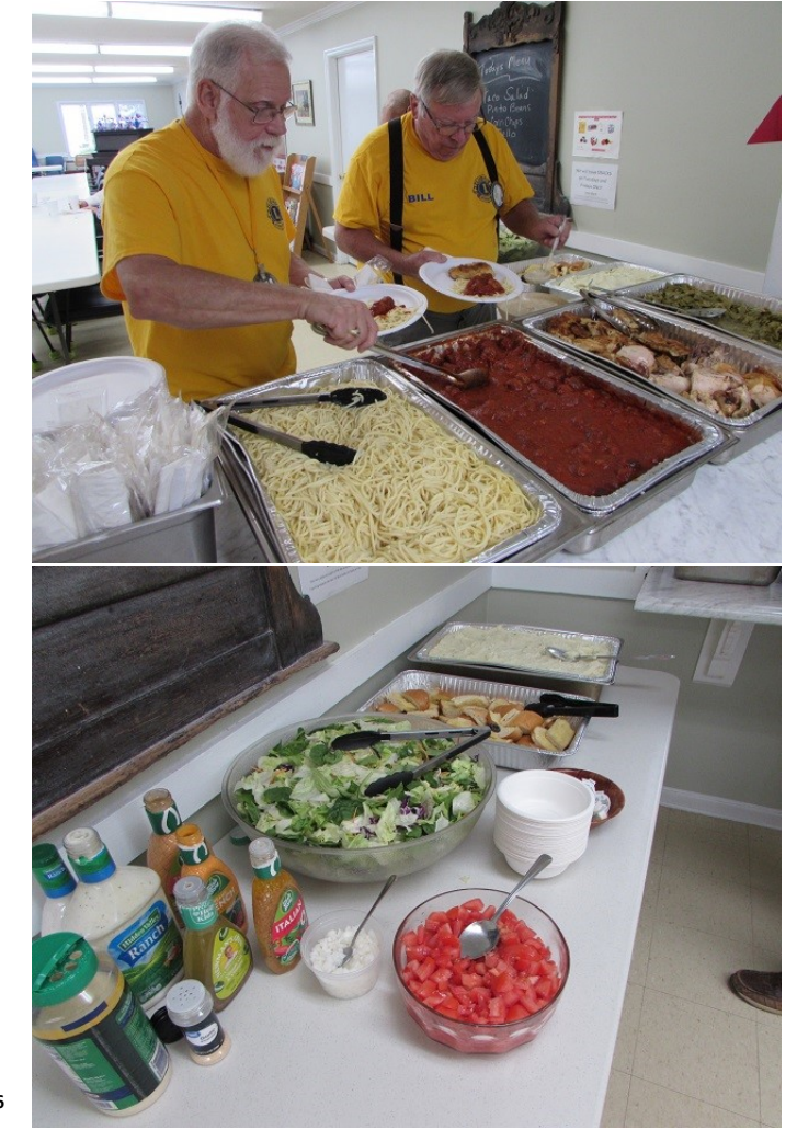
Page 1 of 6