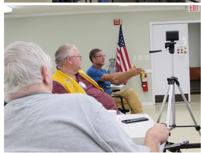
Page 5 of