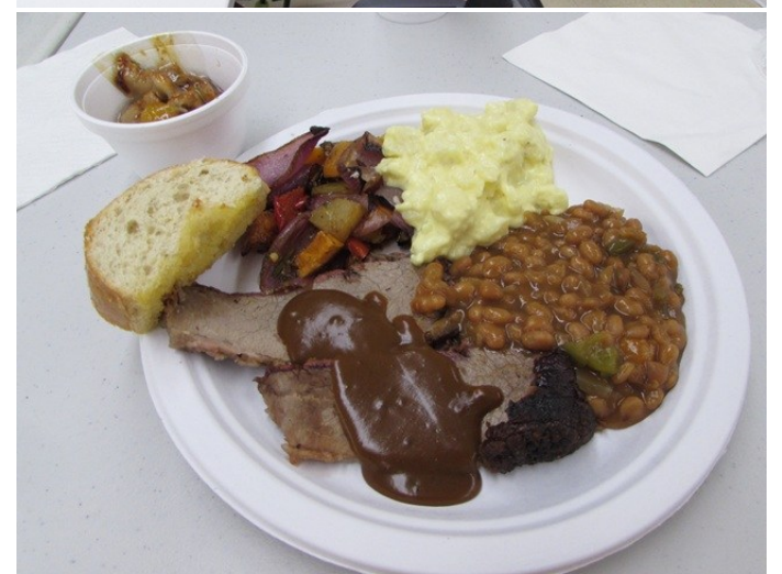
Page 1 of 5