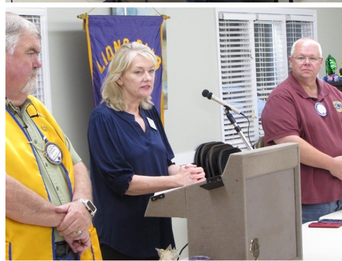
Page 3 of 5