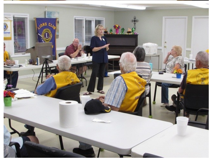
Page 4 of