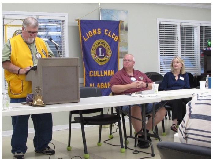
Page 2 of 5