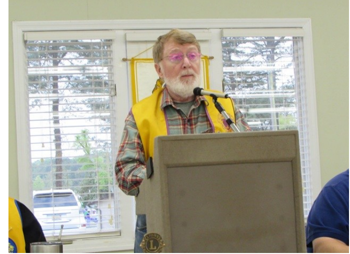
Page 3 of 7