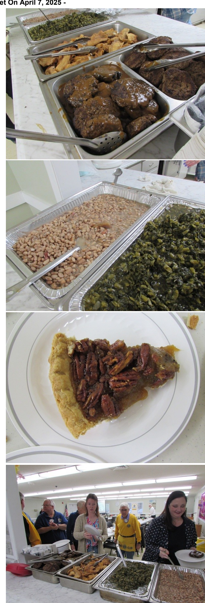
Page 1 of 7