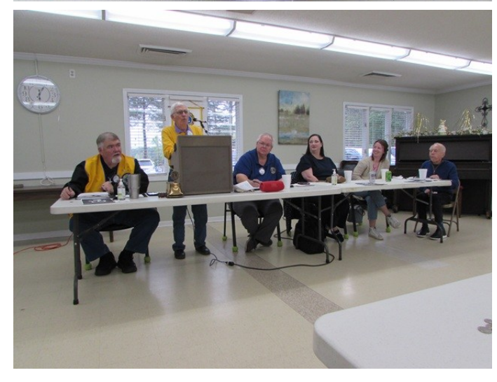
Page 2 of 7