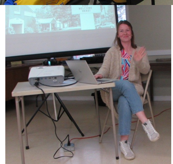
Page 4 of 7