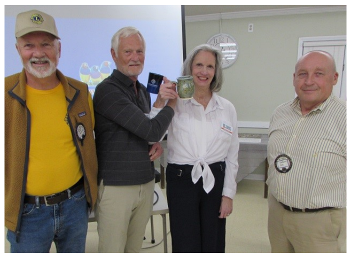
Page 4 of 5