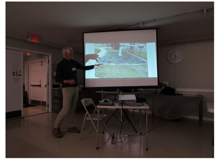
Page 2 of 5