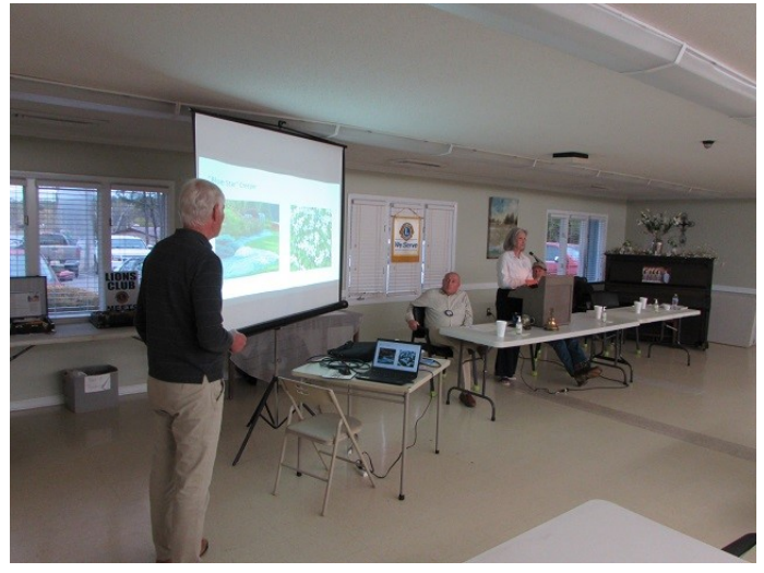
Page 3 of 5