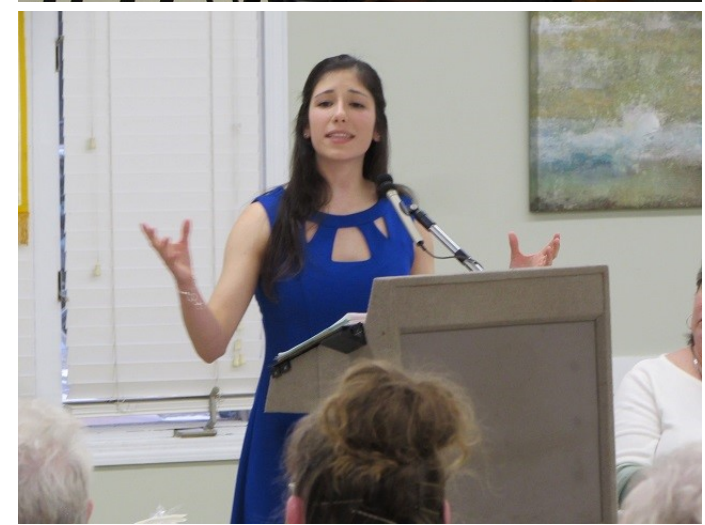
Page 6 of