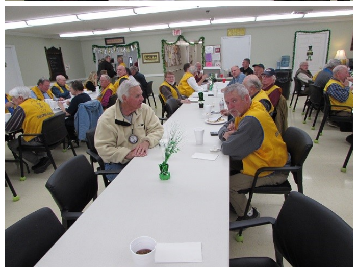
Page 3 of 8