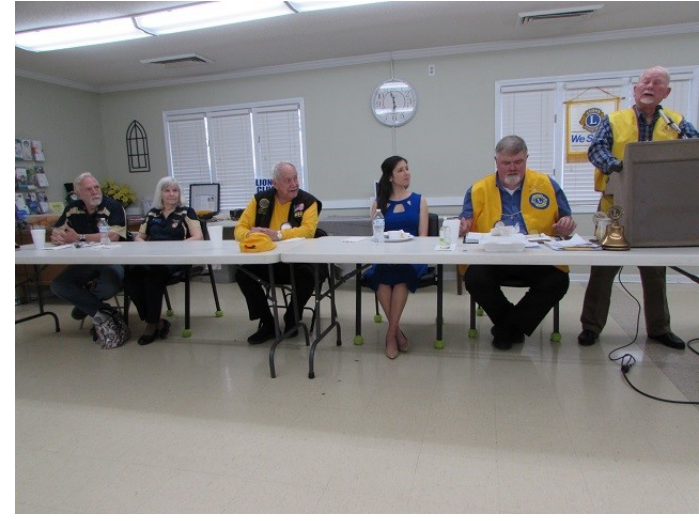
Page 2 of 8