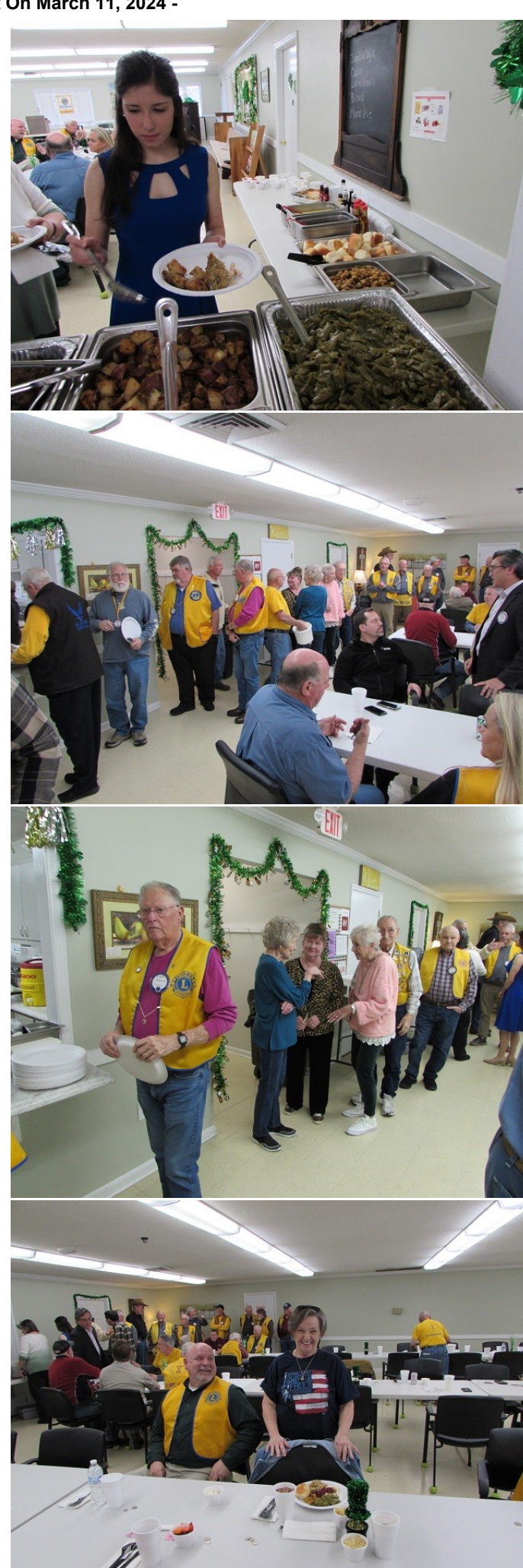
Page 1 of 8