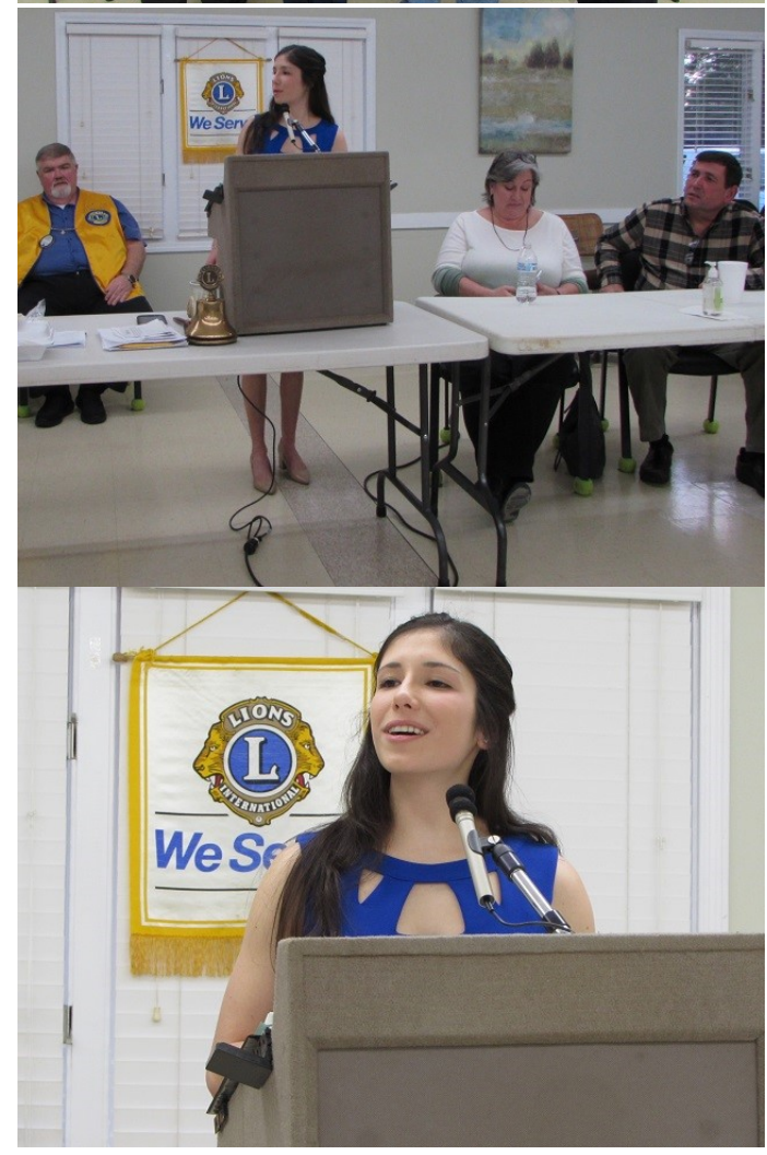
Page 5 of 8