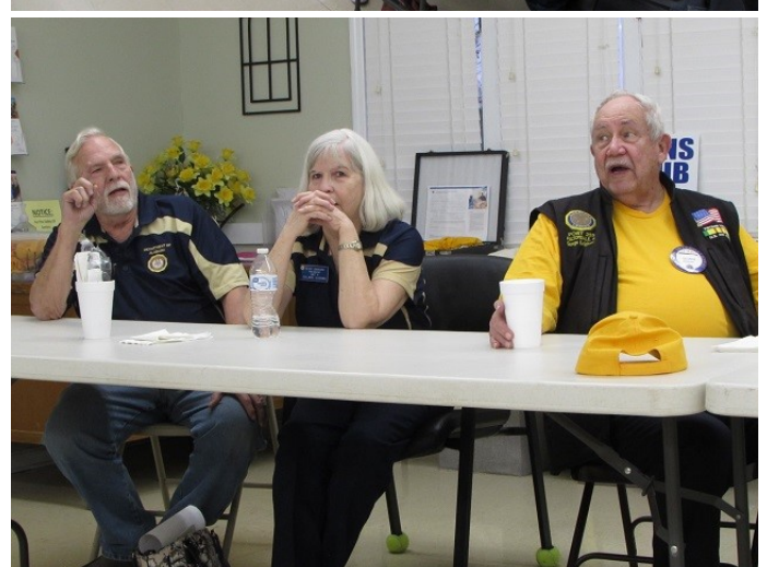
Page 7 of 8