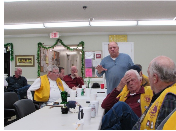
Page 4 of 8