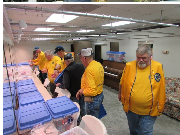
Page 3 of 6