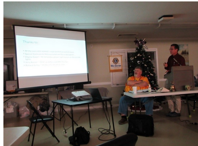
Page 5 of