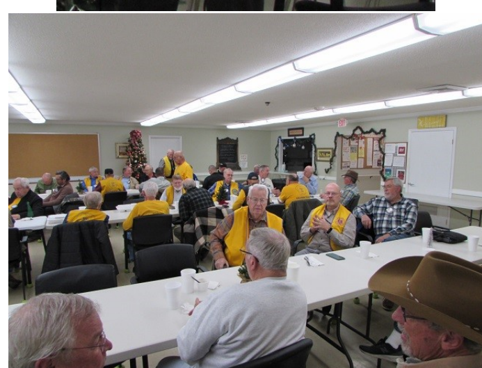
Page 2 of 6