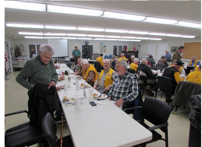
Page 1 of 6