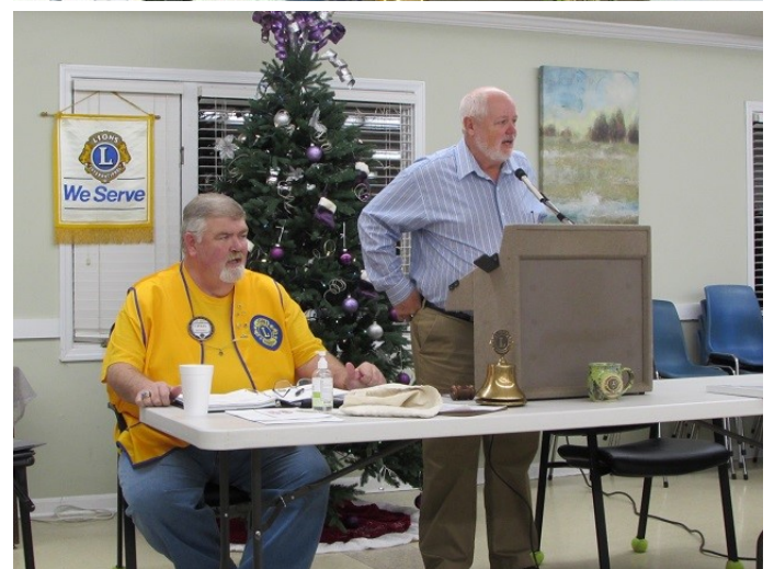
Page 4 of 6